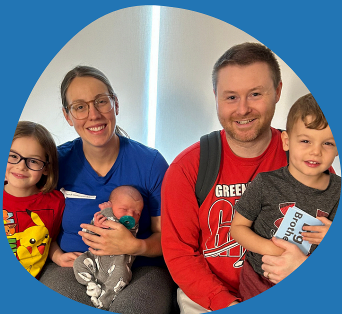
Dean Fundraising Committee Chair